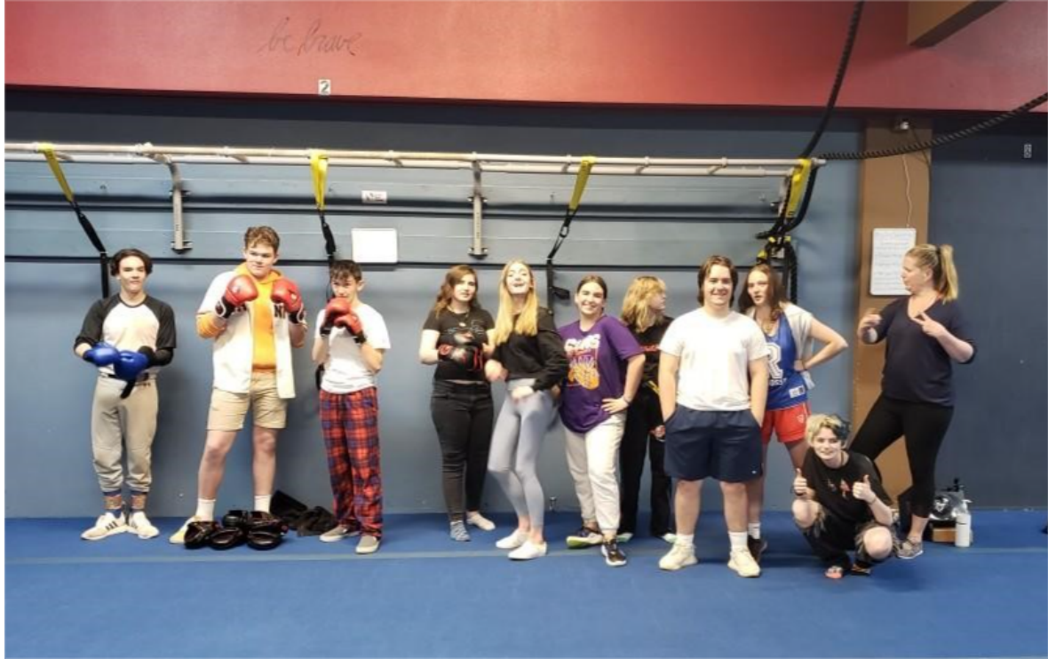
On this particular activity, we had one of our Young Women who just earned her black belt teach us some Karate and Jujitsu kicks and punches.