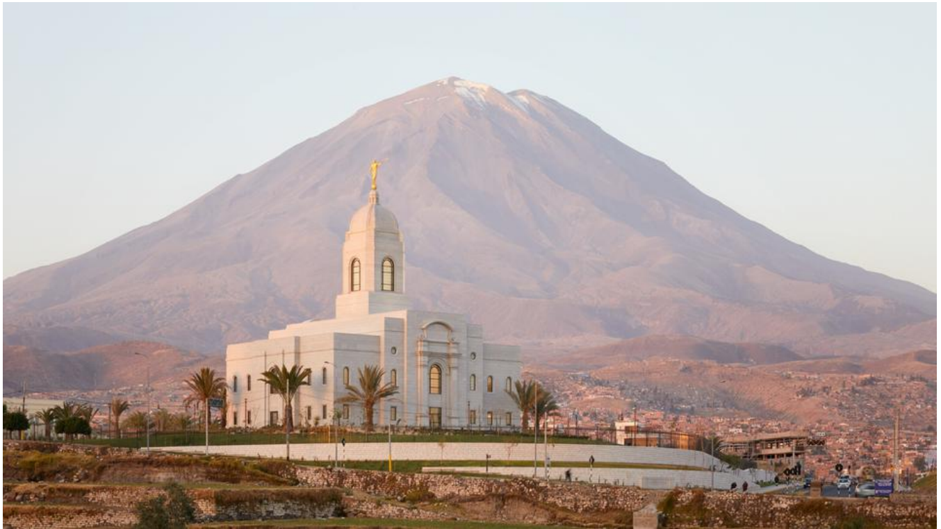
(Arequipa Peru Temple)