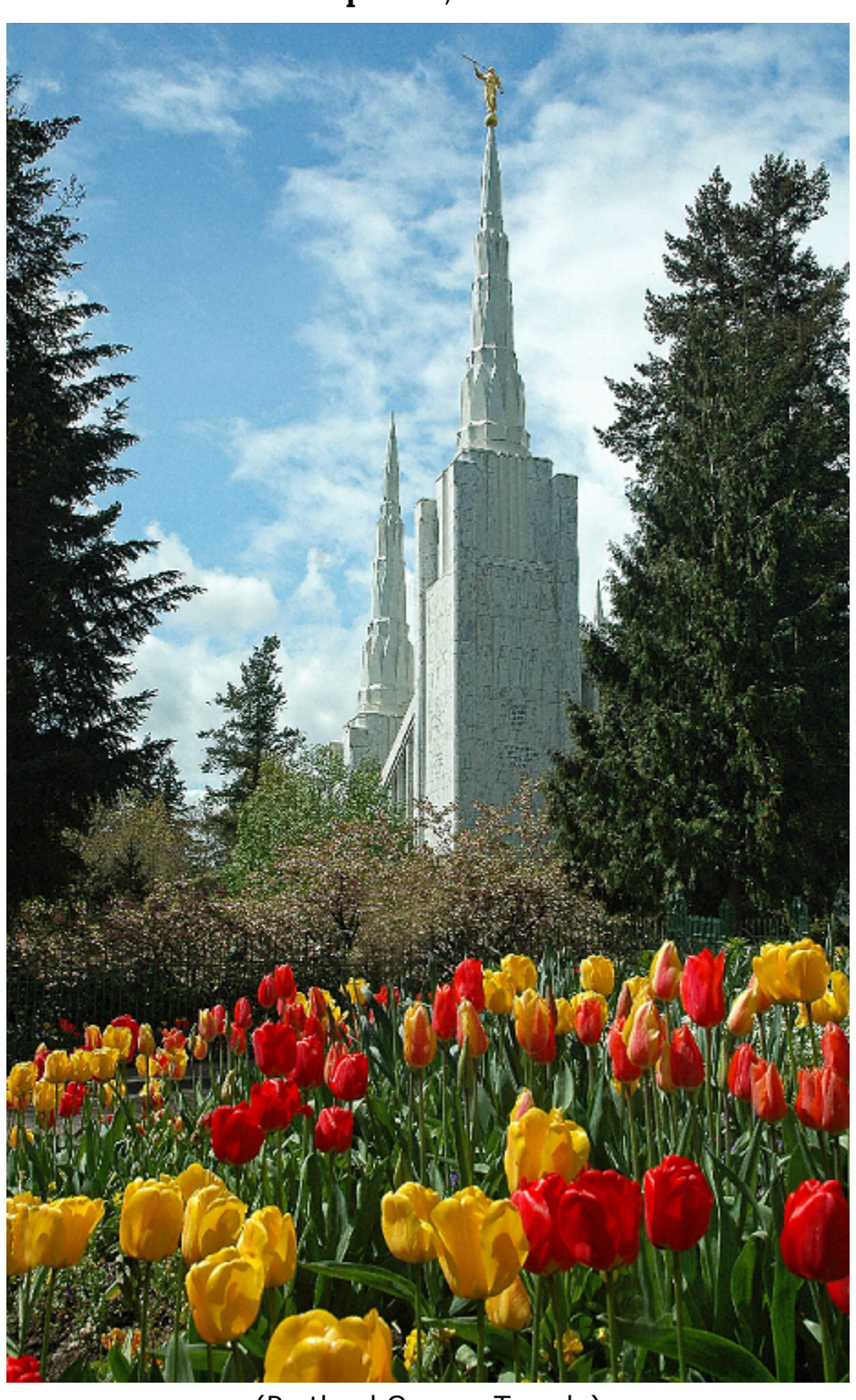
(Portland Oregon Temple)