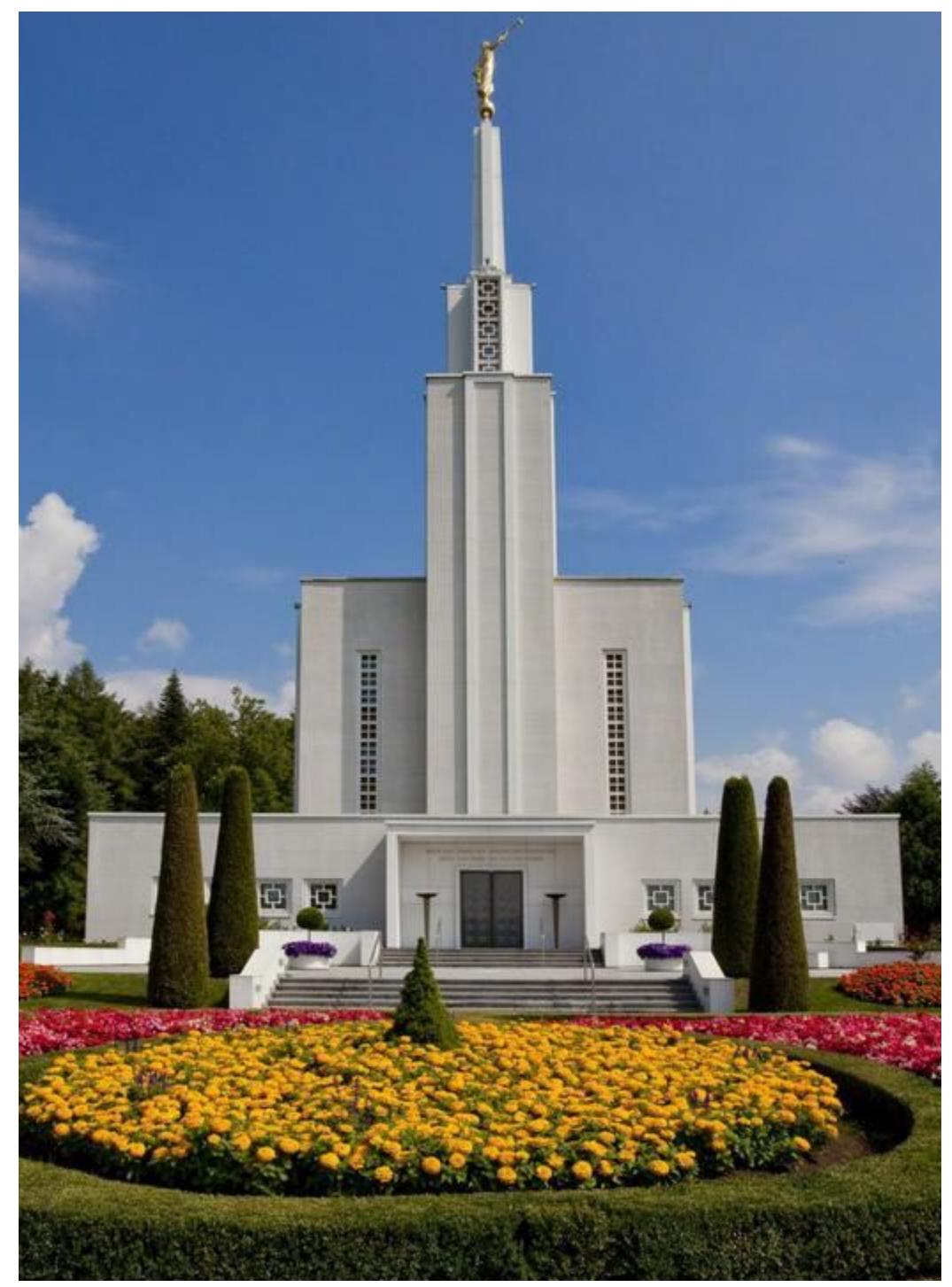
(Bern Switzerland Temple)