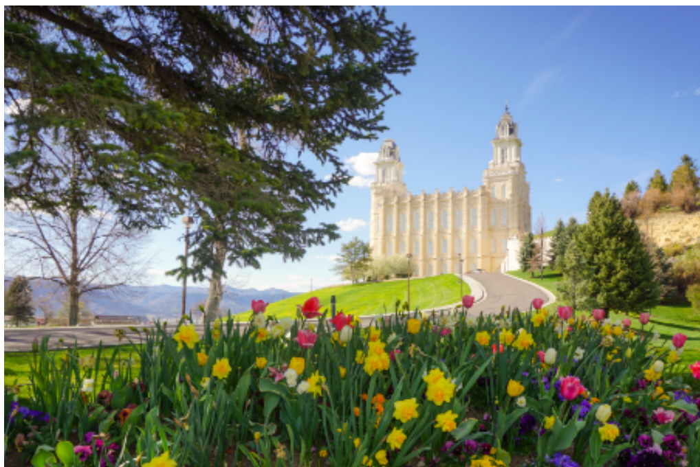
Manti Utah Temple