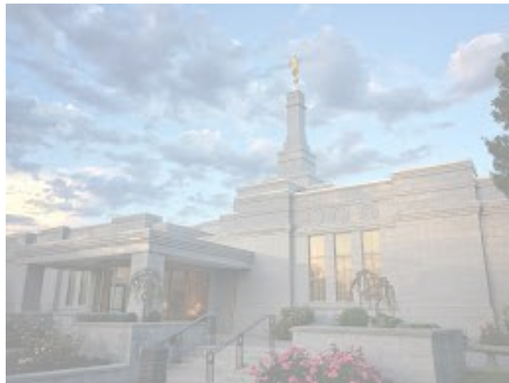
Reno Nevada Temple