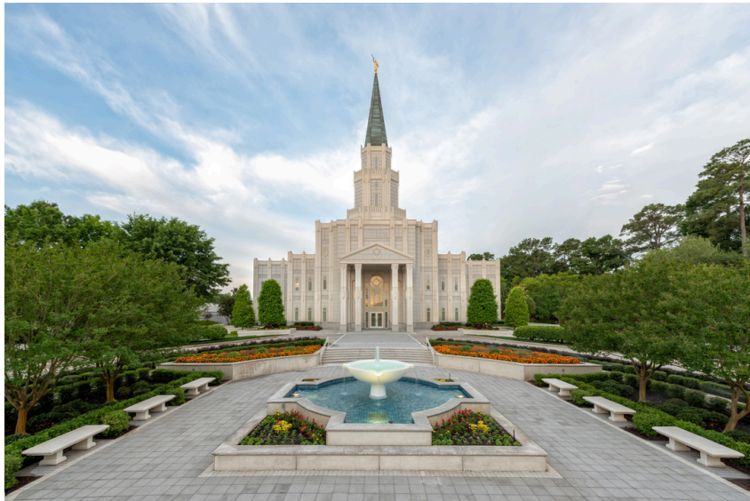
Houston Texas Temple