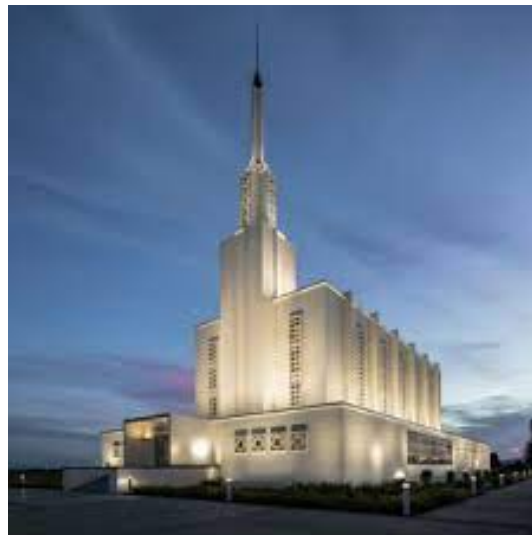
Los Angeles Temple